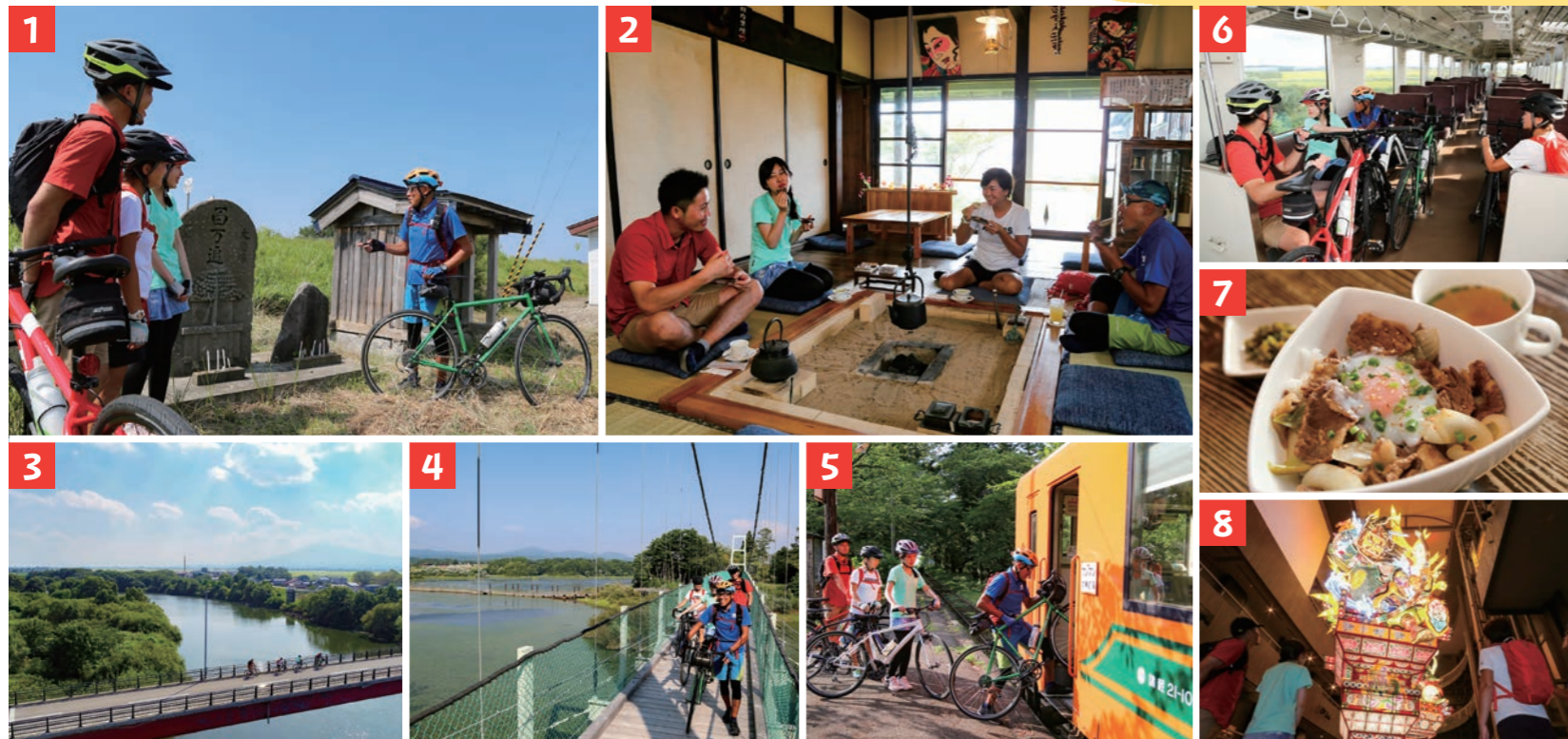
1 Visit places you would normally pass by, and discover the local culture and way of life. 2 Take a short break in the Hinaya tearoom inside Kadarube, a traditional Japanese house full of history. Perk up with some traditional Japanese sweets. 3 With Shirakami Sanchi as its source, the beautiful Iwaki River flows gracefully across the Tsugaru region. 4 Ashino Park is famous for its cherry blossoms. The park is filled with tranquil scenery, and the Tsugaru Railway passes through the park grounds. 5 The Tsugaru Railway, popular among international and domestic visitors alike, allows you to board their trains with your bicycle without disassembly. 6 Looking out from the traincar windows, you can get great views of the rural and small-town landscapes of the Tsugaru Plains with Mt. Iwaki in the background. 7 The Ekisha Cafe is just next to Ashinoko Station. Inside, you can indulge in specialty horse meat cuisine within the nostalgic atmosphere. 8 Tachineputa, the towering festival floats considered the symbol of Goshogawara, are housed in this 7-story building made specially to fit them. You can come see these summer festival icons all year round.